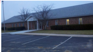
Come See our new digs!