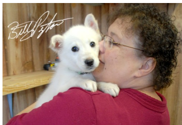
You can be part of the change you wish to see in the world.

Gifts to the Humane Society of Madison County are tax deductible as allowed by law.