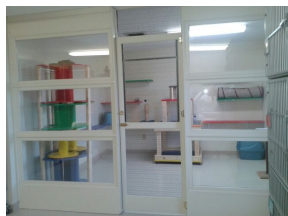
Be a part of something great!