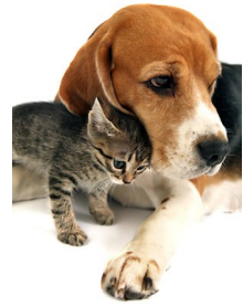
The notes was posted low for them to read.

"I cannot buy anything bigger than a king sized bed. I am very sorry about this."