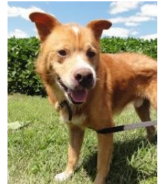
Little things add up to big things.

From all of us at the shelter we wish you a Valentine's Day full of warm hugs.