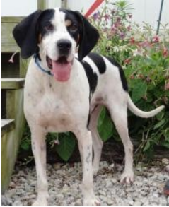
Help us find Arthur a home!

“We can do no great things; only small things with great love.”