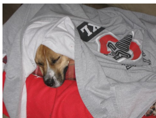
You helped us find forever homes like this one!

We look forward to another great year serving the community.