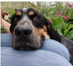
Come make a difference, walk, pet, groom, hang out with our animals

This month is all about love and celebrating that love. This issue of the newsletter celebrates many things, our love of animals, the things we can do to help them, and how who we are drives us to do what we do.