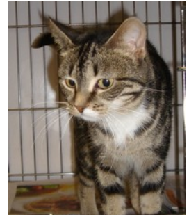
I'm part of the princess castle collection.

Information is available on www.petfinder.com or by calling the shelter at 614-359-7560