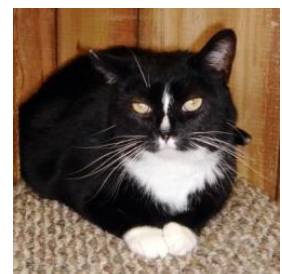
Pitty hopes you get lots of warm furry hugs!